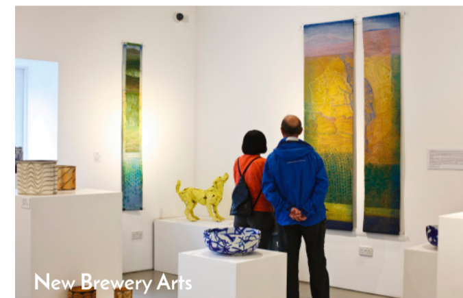
New Brewery Arts